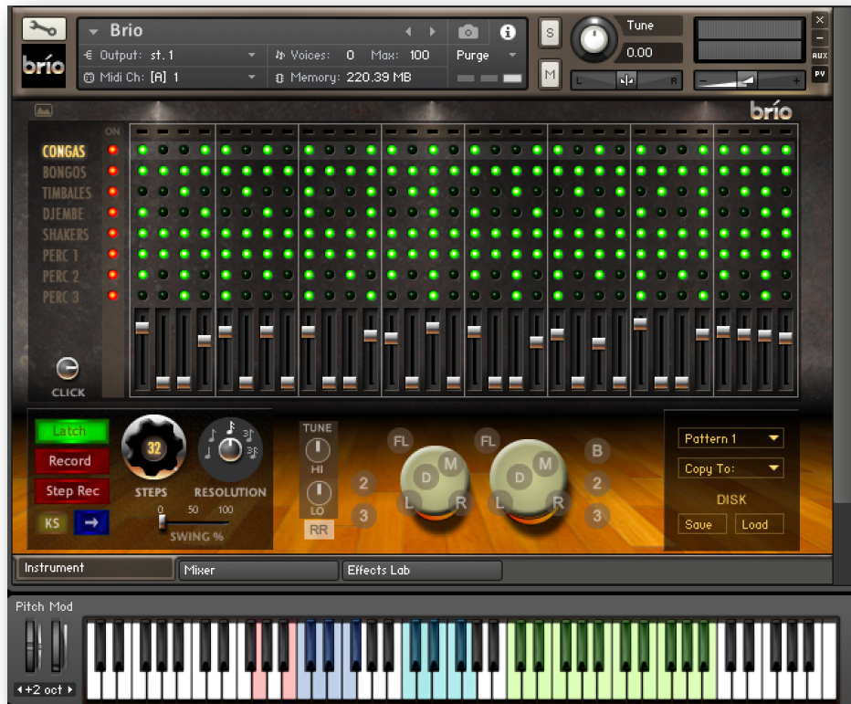
Stop latched Pattern